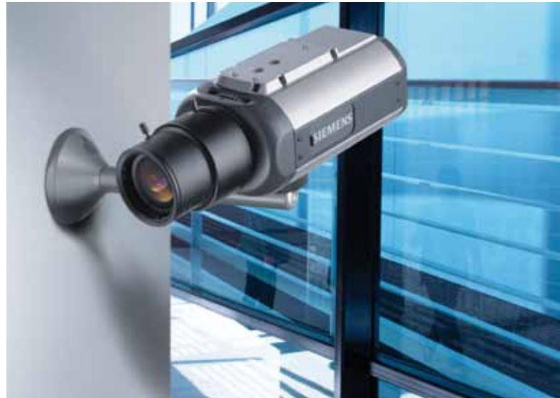
Video surveillance camera from Siemens