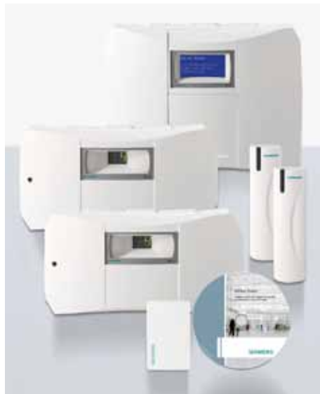
SiPass Entro starter kit