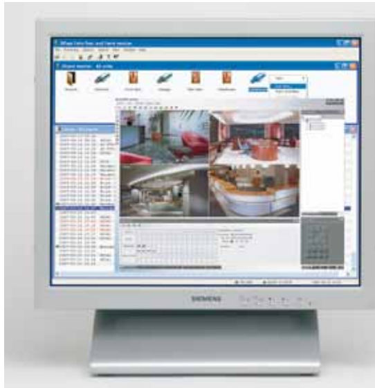
Video recordings are accessible directly from the SiPass Entro software