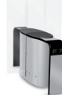
SmartLane 912 Twin with Enhanced Entrance/Exit Control and Compact Footprint Footprint*: 2000 x 1450 mm (78 3/4 " x 57")