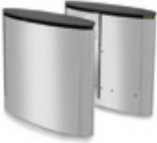
SmartLane 900 with Compact Footprint Footprint*: 1200 x 1200 mm (47" x 47")