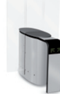
SmartLane 911 Twin with Enhanced Entrance Control and Compact Footprint Footprint*: 1600 x 1450 mm (63" x 57")