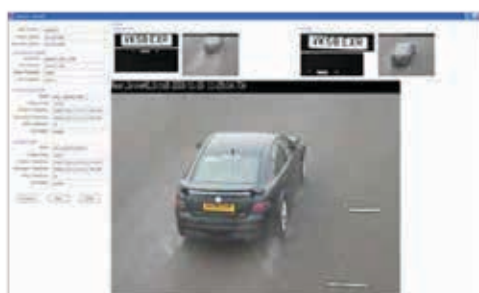
Violation details showing one plate