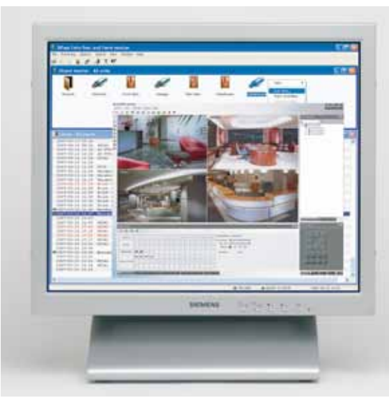
Video recordings are accessible directly from the SiPass Entro software