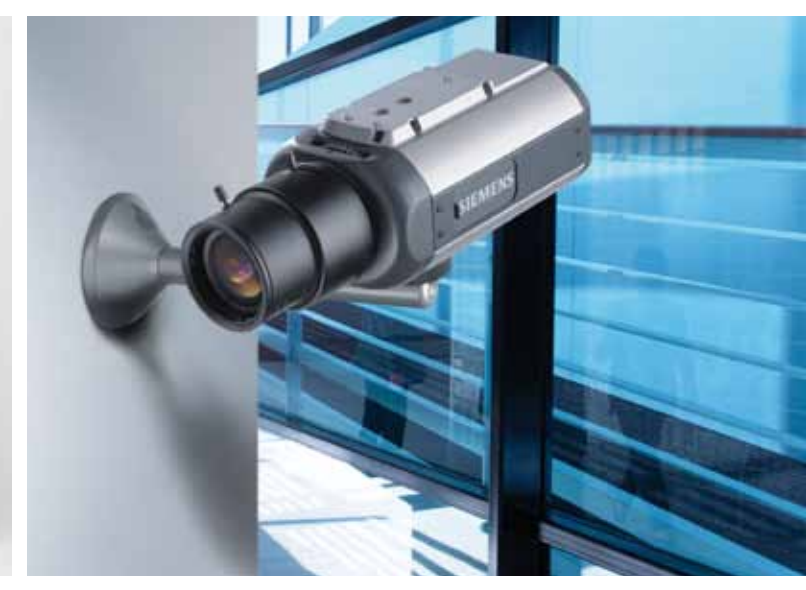
Video surveillance camera from Siemens